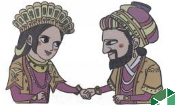
Shah Jahan and Arjumand Banu

Banu was the wife of Emperor Shah Jahan. The emperor loved her very much. After Banu's death, Shah Jahan was extremely sad. He immediately called the best craftsman in the country and spent a lot of wealth to construct the Taj Mahal as the mausoleum of Banu.