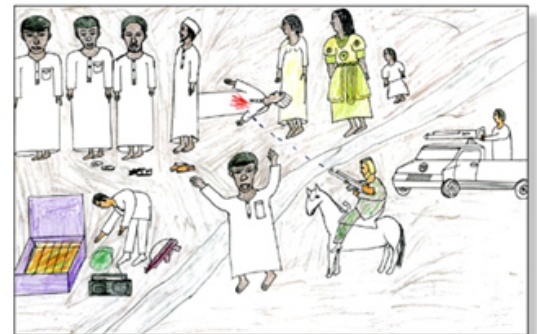
This sketch by a boy from Darfur depicts a typical scene of destruction in his community.

Have you ever asked your parents or teachers why do wars happen? Why can't people just make up? Sometimes adults will say, "it's more complicated than you think" or "you're too young to understand". Well, at 3Dux, we think you are not too young to understand. You have to learn how to resolve problems with friends and family every single day, and you probably have some very good ideas. We want to know what your ideas are.